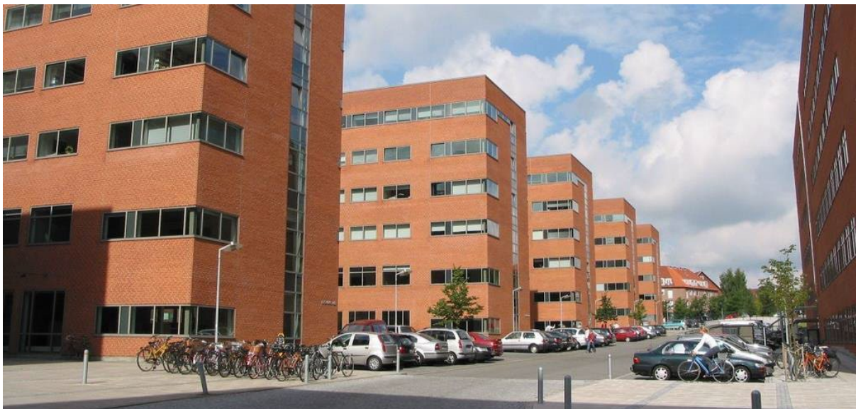
Nobelparken.

If you experience any unacceptable behaviour towards you, there is someone you can contact, and AU encourages you to seek help and counselling. Read more here .