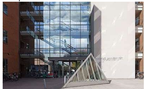
Nobelparken.

When you start as a student at the English department, you will be assigned a study group which you will be working in for the duration of your first year at the university. The study groups are a great way to make new friends as well as help each other out with the readings and assignments you have for each week. During the orientation week, you will hear much more about study groups and what they are used for. After the orientation week, there will be a workshop for you and your study group to take part in as well.