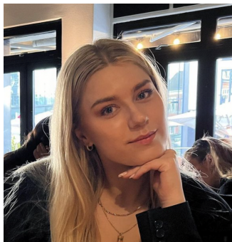
7th semester Head Tutor