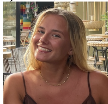
7th Semester Head Tutor