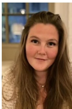
7th semester Head Tutor