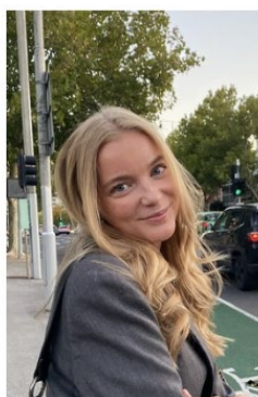
7th semester Head Tutor