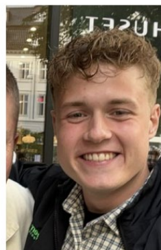
7th semester Head Tutor